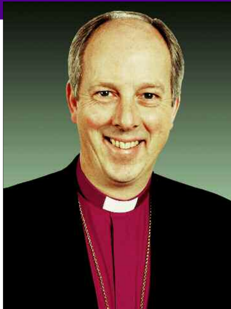
Bishop of Derry and Raphoe